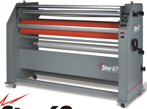
Star 62 Mounter / Laminator