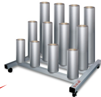
Star Cart 12