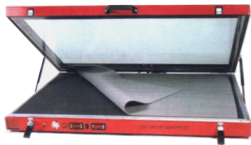
Hot Glass Press

Specializing in thermal and pressure sensitive laminating films and mounting adhesives as well as supplies for heat presses.