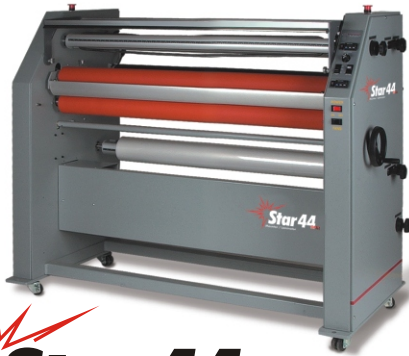
Star 44 Mounter / Laminator

Simplicity in Mounting and Laminating with Professional Results!